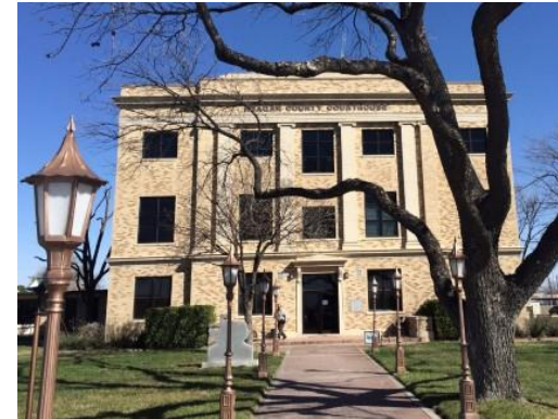
REAGAN COUNTY COURTHOUSE