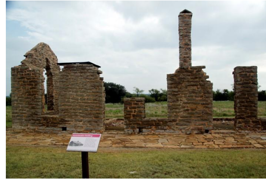
Fort Griffin Historic Site

Walk Rating: 2A Start Time: Dawn to 3 hrs before dusk, 7 days a week.