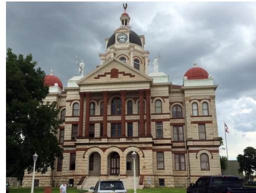
Coryell County Courthouse

Walk Rating: 1A Start Time: 7:00 am to 3 hrs before dusk, 7 days a week.