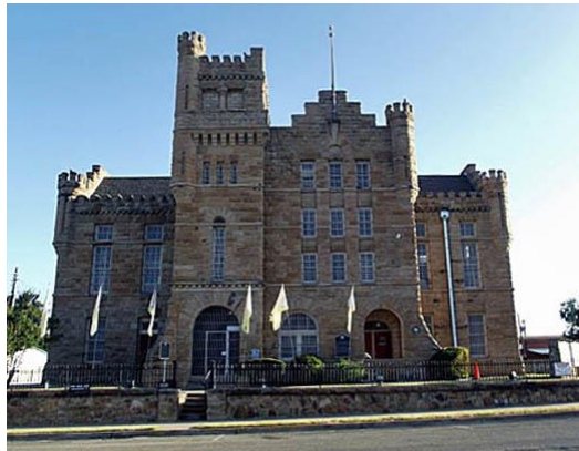
Old Brown County Jail

Walk Rating: 2A Start Time: Daily 8 am to 4:30 pm, gate closes at 5:00 pm.