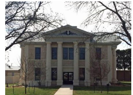
Glasscock County Courthouse

County Seat in sparsely populated ranching and oil country; city streets and sidewalks. This walk is rated 1A.