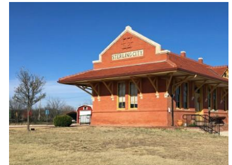
Old Railroad Depot

Small Texas town on Edwards Plateau. Highlights include High School, Courthouse, athletic facilities, neighborhoods, and old railroad depot. This walk is rated 1A.