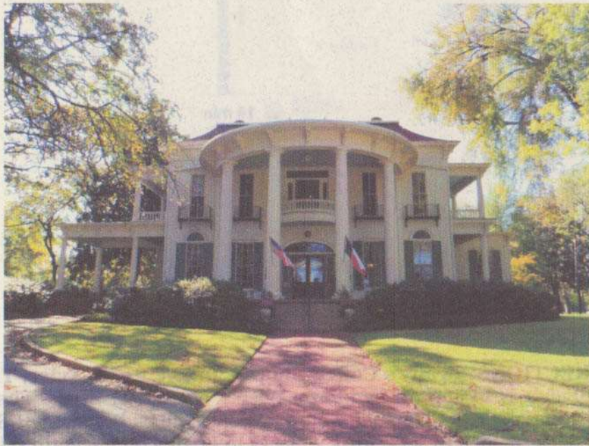
Goodman House Museum