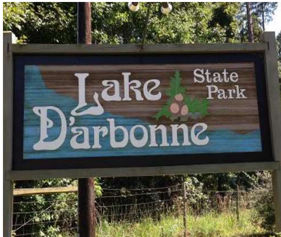
Lake D'arbonne – Parish Rd 4410, Farmerville