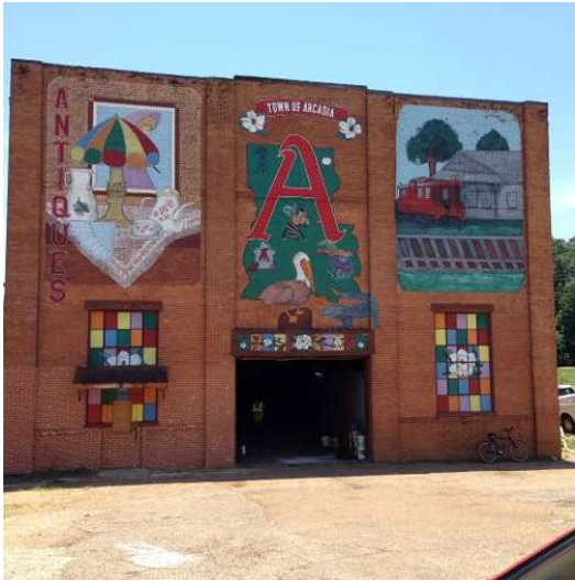
Arcadia Visitor – 1876 N Railroad St