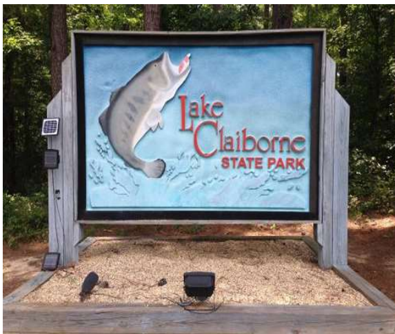
Lake Claiborne – 225 State Park Rd, Homer