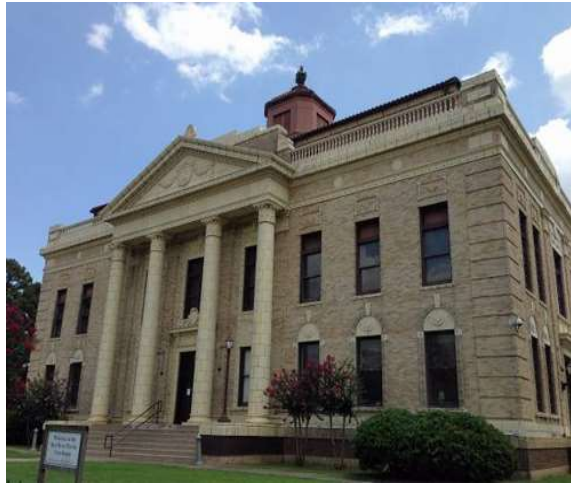
Red River Parish Courthouse – 615 E Carroll