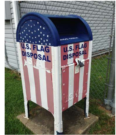
Louisiana Military Museum – 201 Memorial Dr