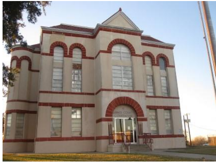
By Larry D. Moore, CC BY-SA 3.0 https://commons.wikimedia.org/w/index.php?curid=867462 ; resized to 427 x 320