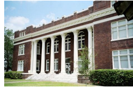
By Billy Hathorn, CC BY-SA 3.0 https://en.wikipedia.org/wiki/Karnes_County,_Texas#/media/File:Karnes_County,_Texas_Courthouse_IMG_2720.JPG ; resized to 480 x 311