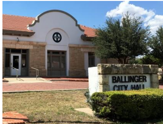
Old Santa Fe Depot, now City Hall.

Walk includes courthouse, cemetery, old jail, post office, museum, local shops, Farmer's Market (when in season), and Owl Drug - a local favorite for breakfast and lunch.