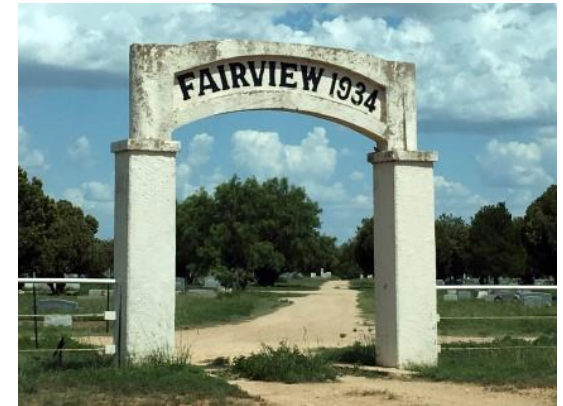
Fairview Cemetery entrance.

The Garden of Eden, an old rail depot, city park, neighborhoods, museum, county hospital, post office, and historic city plaza are features of this walk