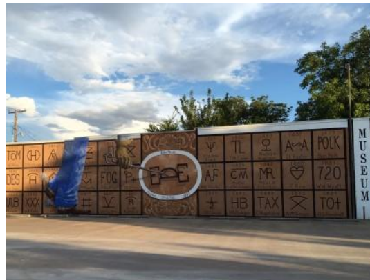
Mural on wall of Don Freeman Memorial Museum.

Walk includes County Courthouse, old rail depot, Carnegie Library (1 of only 3 active in Texas), churches, post office, city park, & neighborhood.