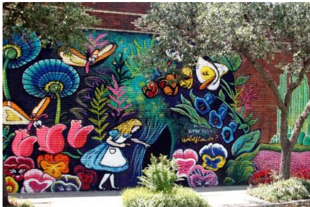
Part of larger mural on side of public library.

Register and then drive to each individual Start Point. Directions are in Walk Box.