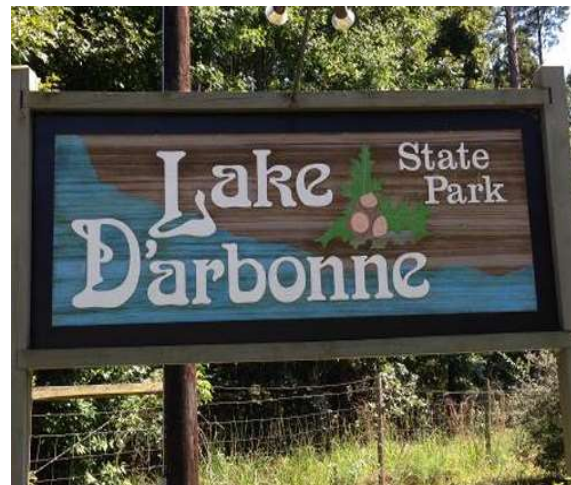
Lake D'arbonne – Parish Rd 4410, Farmerville