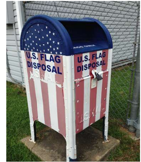
Louisiana Military Museum – 201 Memorial Dr