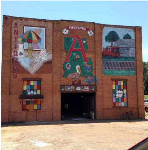
Arcadia Visitor – 1876 N Railroad St